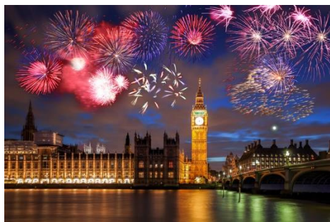
New Year's Eve