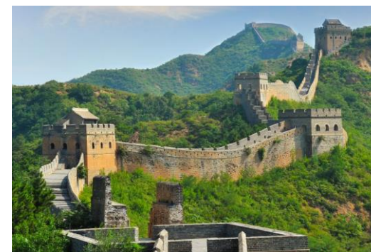
The Great Wall of